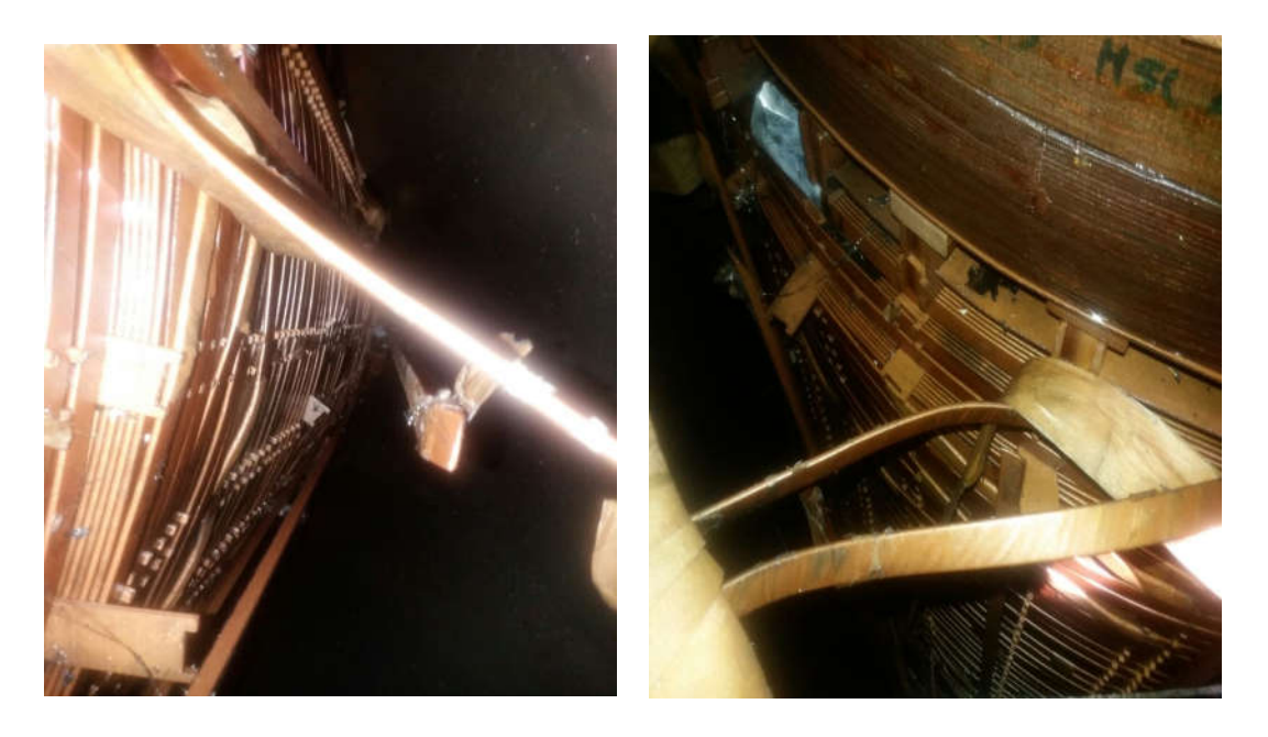
Exhibit-VExhibit-VIf) There was no provision for fire protection of the transformer in the substation.

e) Transformer was checked for internal damage through inspection window. As transformer was refilled with oil to prevent moisture ingress, damaged windings were not visible from the inspection window. However, following photographs of windings taken after opening of the tank were provided by DTL (Exhibits V and VI). The damage to the windings can be seen in these photographs. Some burnt material can also be observed.