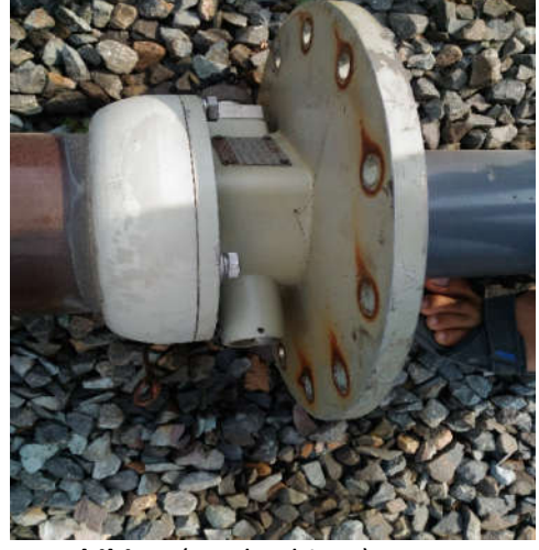
Exhibit-II (MV bushings)

c) There was no visible sign of bulging of the tank or cracks on the tank (Exhibit III).