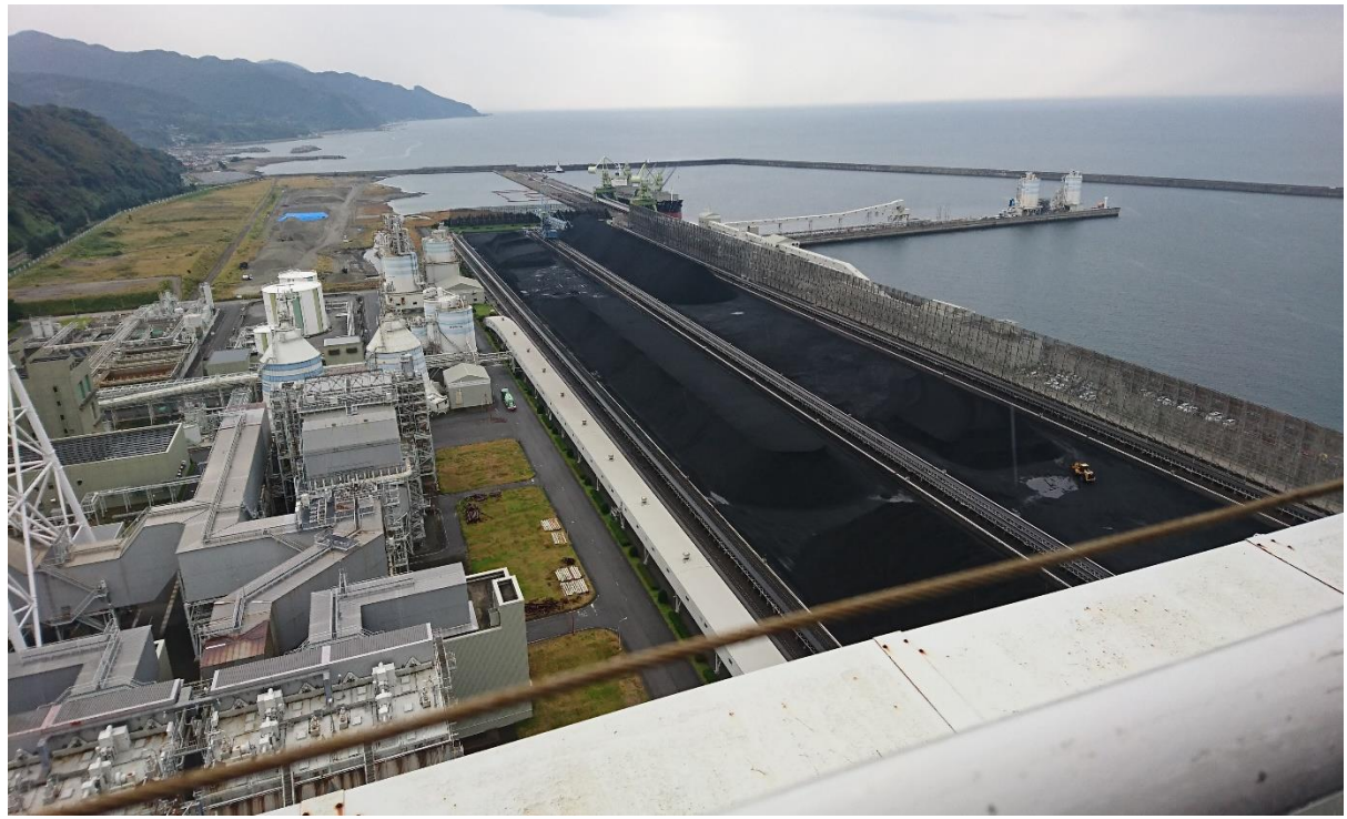
Reihoku: Coal yard