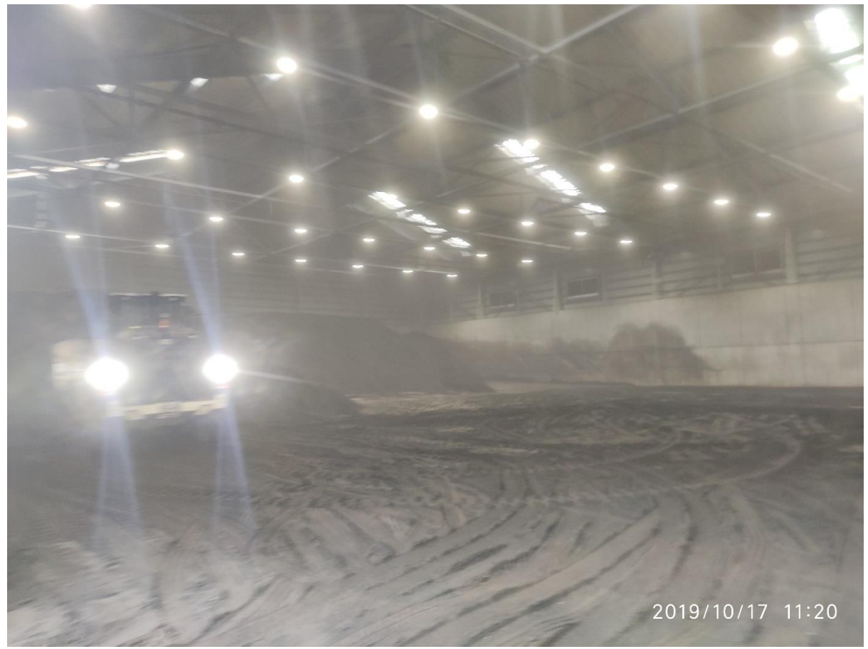
Hibikinada: Covered coal yard