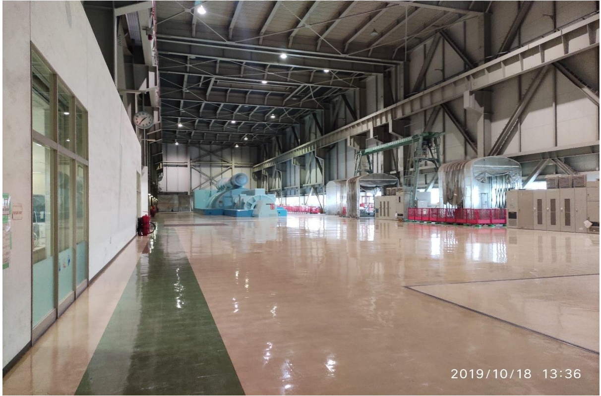
Reihoku: Turbine Floor