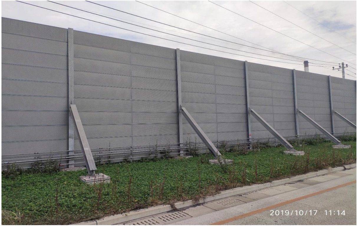
Hibikinada: Modular perimeter wall